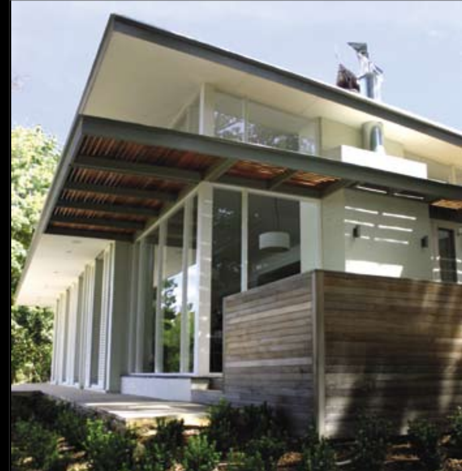
AWARD OF MERIT Yantaringa - Aldgate Residence Williams Burton Architects