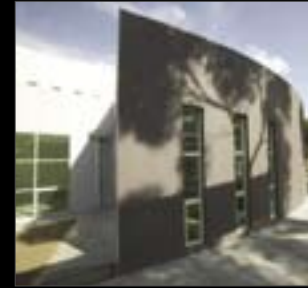
COMMENDATION Automated Solutions Australia Chapman Herbert Architects