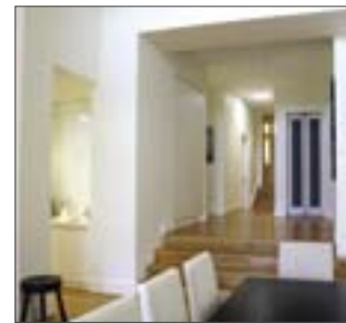
Yantaringa - Aldgate Residence Williams Burton Architects Fairweather Constructions>Fielders Steel Roofing>Cida Group