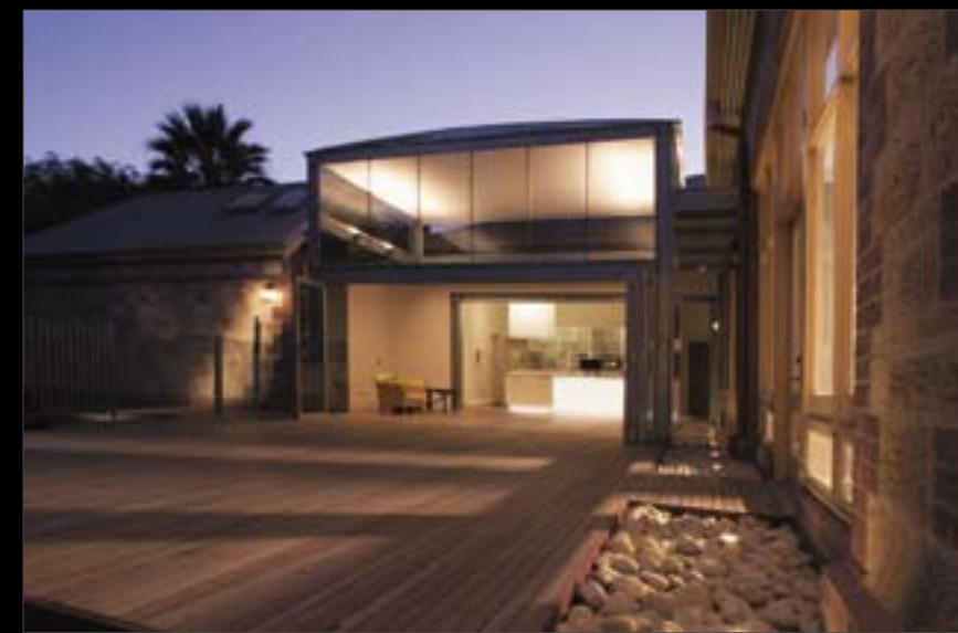
COMMENDATION The Dowe House Tectvs