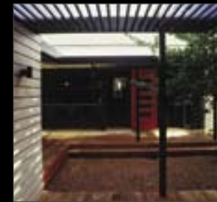
Walkerville Additions Mulloy Studio Thorne Constructions