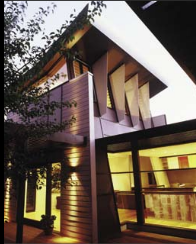
COMMENDATION Walkerville Additions Mulloy Studio

This project demonstrates a high level of refinement and consideration, and is delightfully detailed in all respects. With a strong environmental focus, the architect has achieved a richly textured solution, which responds perfectly to the client's lifestyle and priorities. The shape of the building gives many varied views of both the exterior form and glimpses through to interior spaces, ensuring a rich visual experience. Energy efficiency, cost effectiveness, careful detailing and dedicated consideration have produced a valuable architectural outcome.