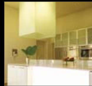
The Dowe House Tectvs Tempo Constructions>Fielders Steel Roofing>Inlite SA