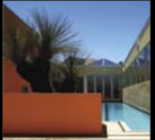
COMMENDATION Winn Residence Warwick O'Brien