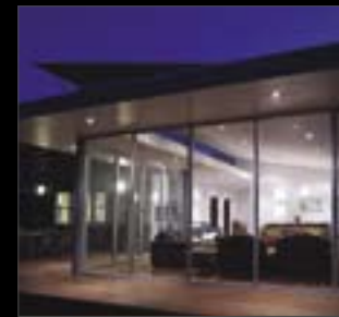
Savvoudis Residence Studio 9 Brenton Olliver Pty Ltd>Fielders Steel Roofing